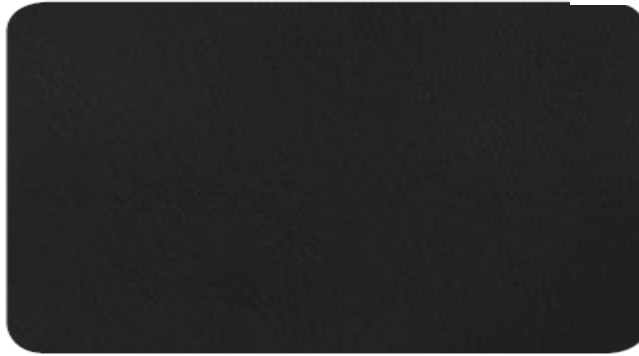
CARBON BLACK NAPPA