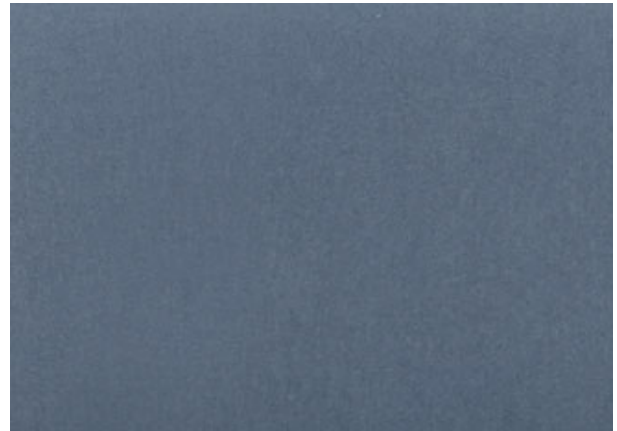
VINYL CHARCOAL SEAT & BACK