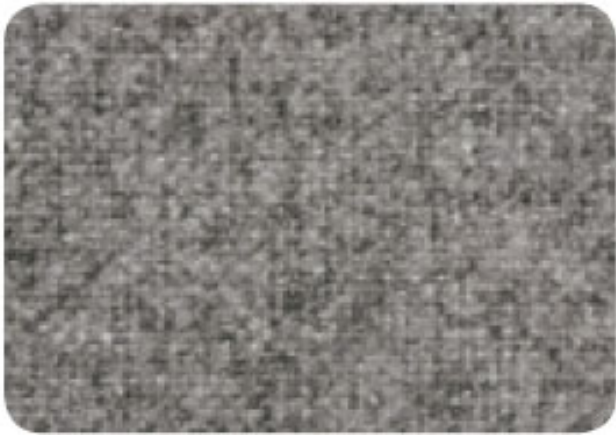
FABRIC TAUPE SEAT & BACK