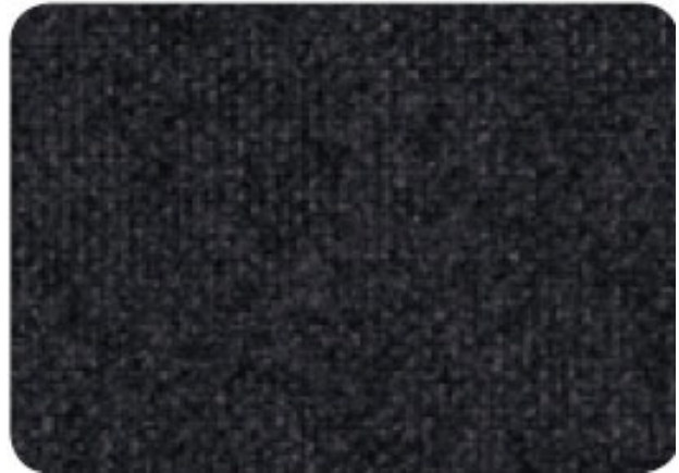
FABRIC CHARCOAL SEAT & BACK