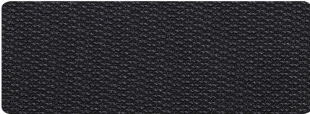
BLACK SHANKAR FABRIC